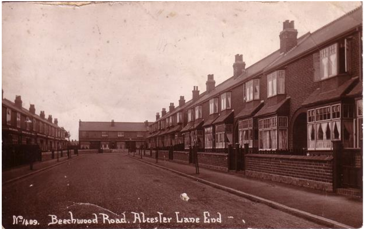
Beechwood Road forms a crescent running between Taylor Road and May Lane and was developed during 1910 and 1911.

May Lane , originally called May House lane linked May House at the top and May House Farm at the bottom. It began to be developed incrementally from 1905 – 1911 by various builders, who were allocated small building plots of up to two, three and five houses.